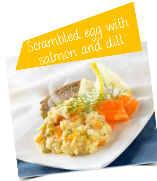
Scrambled egg with salmon and dill