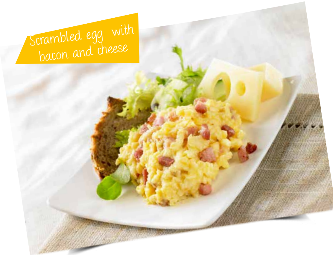
Scrambled egg with bacon and cheese